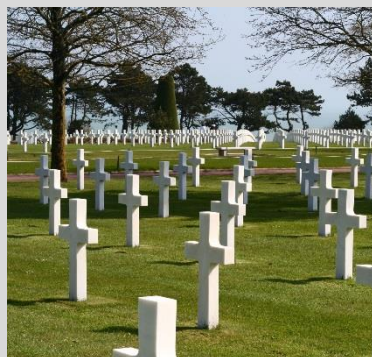
Colleville US Cemetery